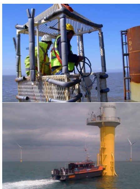
Tendring companies are already playing a major role in the UK Offshore Energy sector.