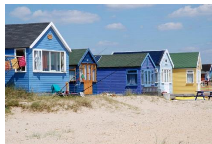
Unique beach side accommodation

4.18 Clacton will remain Tendring's most important and busiest service centre. The town will evolve with an emphasis on quality; providing excellent, cultural, retail, educational and public services. The quality of the town will be a key attractor for new residents and businesses to locate in the area. New cultural infrastructure will support increasing regional demand from Essex's growing populations and will act as a stimulus for increased year round use of Clacton town centre.