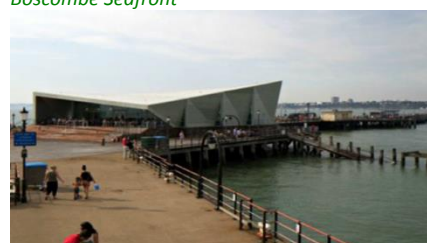
New cultural centre in Southend