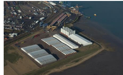
Harwich Offshore Activity