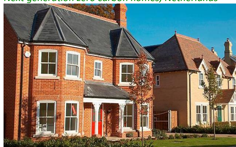
Quality Housing in Tendring

4.31 Development in the West of Tendring will also help to generate demand for new infrastructure, strengthening the case for improvements to the A120 and A133, improved public transport (into Tendring) and the delivery of a more varied educational offer. Achieving this strong new infrastructure should be seen as a fundamental part of the West of Tendring strategy.