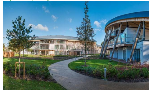
Luxury care facilities at Anchore West Hall in Surrey.