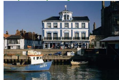
Harwich's strong maritime Heritage