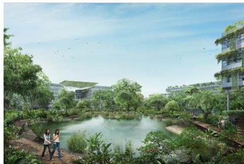
Clean-tech industrial park, Singapore

4.29 The delivery of any potential development at this location is clearly at an early stage. However, (in line with the principles set out in Section 3) an opportunity exists to undertake pro-active planning to deliver a significant driver for growth and employment in the district.