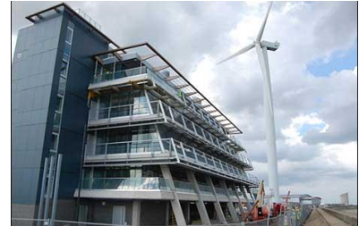
Orbis Energy, Lowestoft