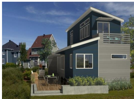
Next generation zero carbon homes, Netherlands

4.30 To ensure that any future development is unique and impactful, options to exploit new techniques in low carbon construction should be explored (potentially driving demand within Tendring's Construction sector). It will be important to define desirable options for employment space which could complement the evolution of target sectors, but which may also provide an opportunity to bring new types of business into the district. Proximity to the University of Essex will also provide opportunities to accommodate educational activities, high technology spin out companies and new start-up businesses. Excellent transport links will attract businesses and residents alike.