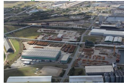
Wind farm manufacturing in Rostock