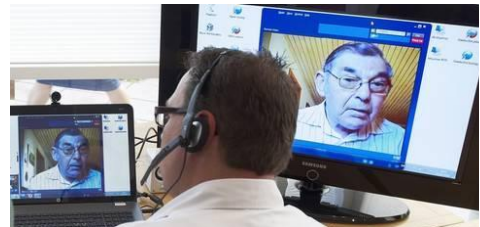
Innovation and technology are increasingly an important part of the Care sector in the UK