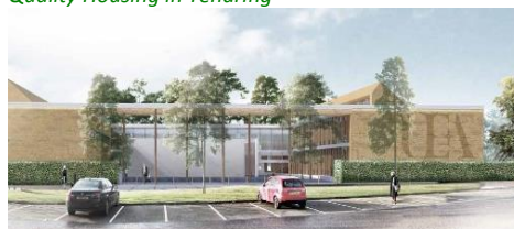
New educational facilities

4.32 It will be important to work with landowners and Colchester Borough Council to test feasibility and ultimately develop a strategy for the release of land on the Tendring and Colchester border. Assuming agreement on a way forward, it will be important to test the demand for potential employment uses and desirable infrastructure (physical and social) for inclusion within evolving plans.